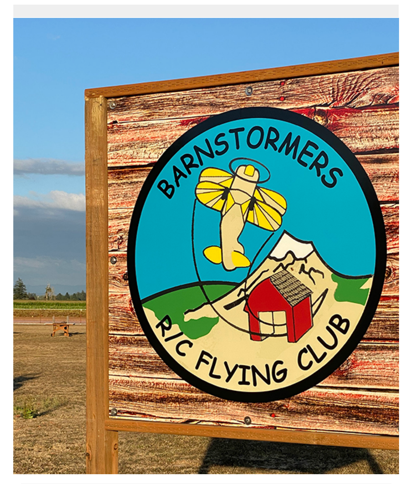
Barnstormers' Newsletter - November 2023