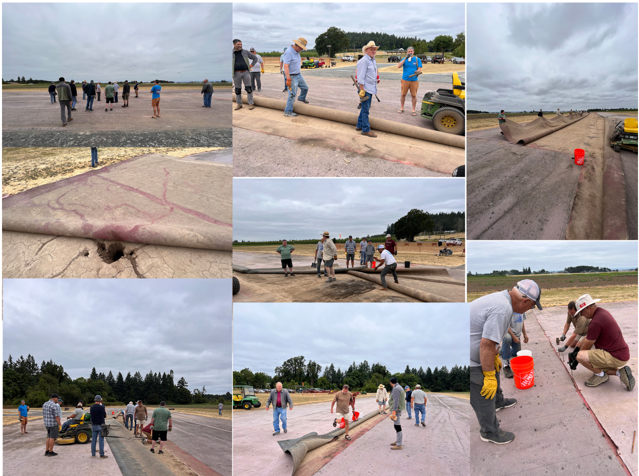
Runway Renewal Program July 8, 2023